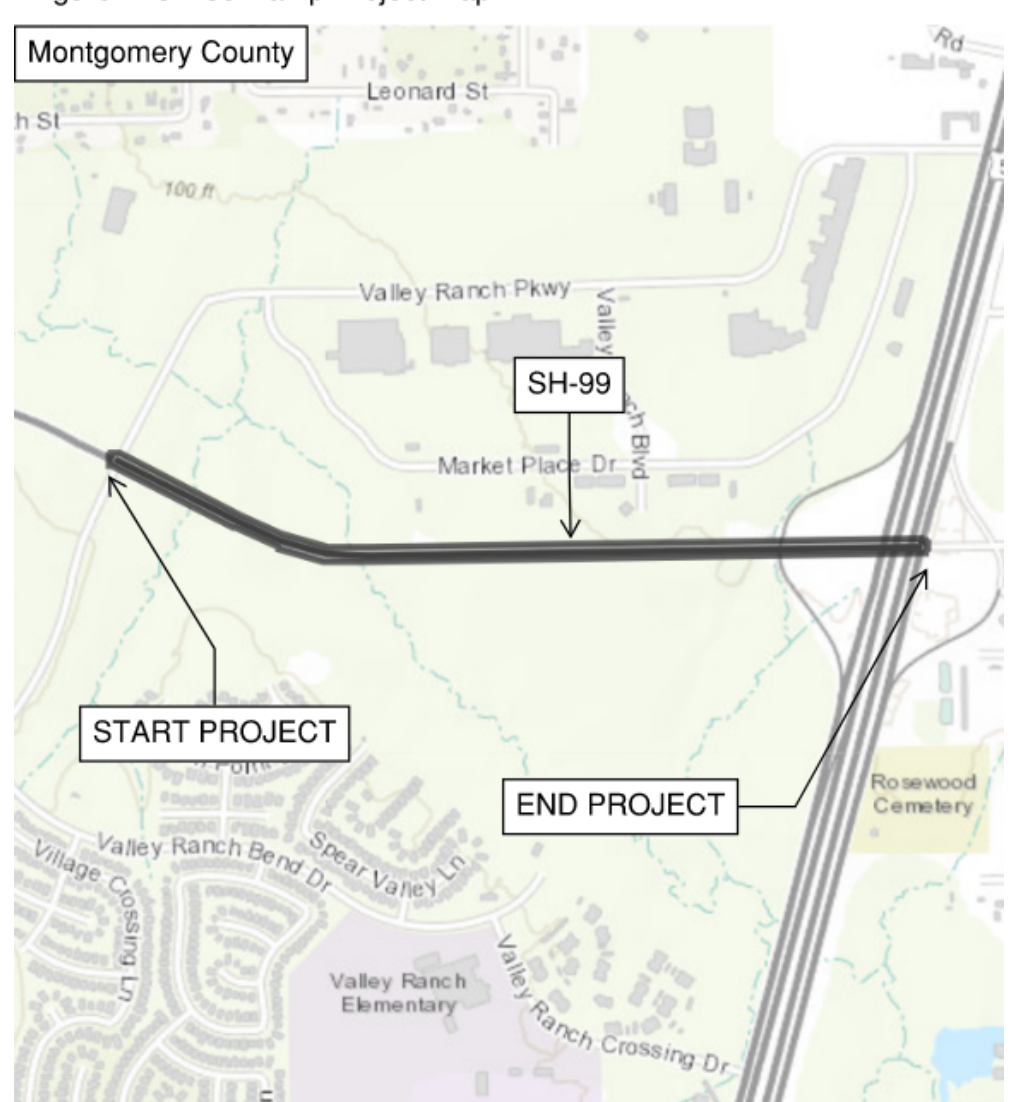
Figure 1: SH-99 Ramp Project Map

New ramps will provide direct access to and from the surrounding community and SH 99. Ramps attract a significant portion of traffic from the surrounding network, reducing the utilization of alternative ramps, frontage road access, and connectors.