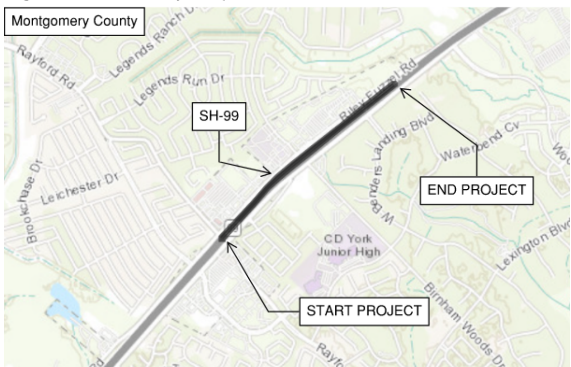
Figure 1: SH-99 EBFR Project Map

SH 99 EBFR improvements will extend beyond the frontage road, adding pedestrian intersection safety elements (crosswalks, ramps, island relief stations, and pedestrian signals) as well as traffic lane improvements.