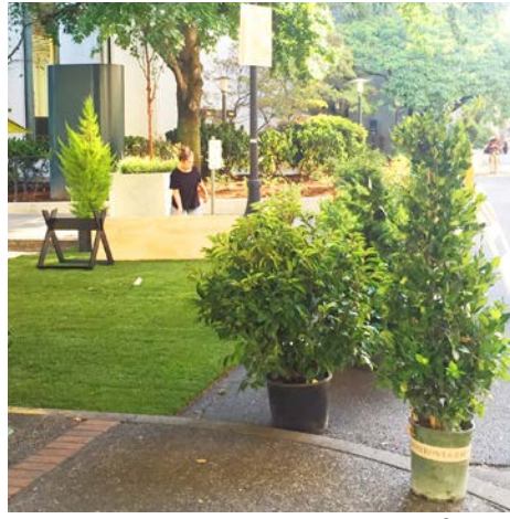
Line sidewalks, parklets, and turf medians with potted trees and plants. They beautify the street and add shade.