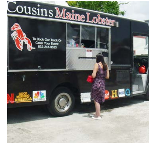
Invite local food vendors to fill popup shops, bring food trucks, or set up booths.