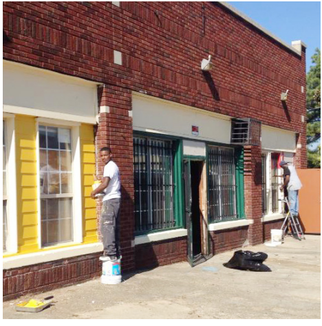
Work with property owners to revitalize deteriorated and/or vacant storefronts. Quick fixes like adding a new awning, painting a storefront, or staging the windows of empty buildings can reinvigorate dilapidated or vacant buildings.