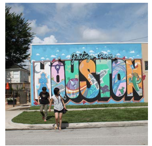
Invite a local artist to display his or her work, or, with the permission of a building owner, paint a mural.