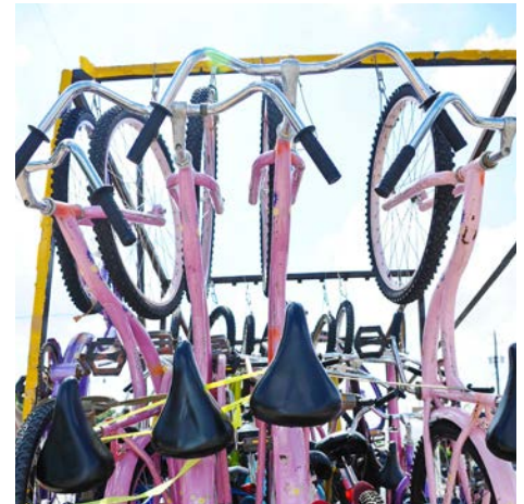
Site bike racks at destinations like pop-up shops, community gardens, and parklets. Make temporary bike racks out of wooden pallets or ask an organization to donate them.