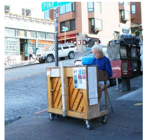
Allow musicians and bands to perform on sidewalks or other public places. Music always attracts people.