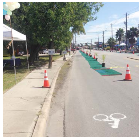
Paint a bike lane on the street or delineate one with traffic cones. A comfortable bike lane is about 6 feet wide.