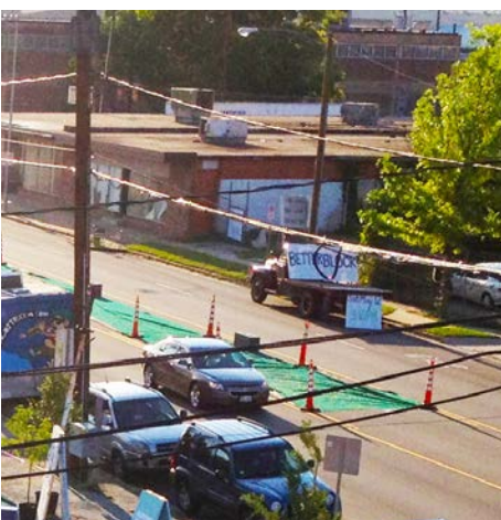
Block off a lane of traffic or turning lane to accommodate a median made of artificial turf.