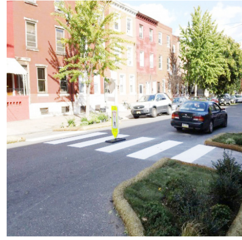
Add curb extensions at street corners. This extension of the sidewalk at intersections protects pedestrians by decreasing the distance to cross the street and slowing turning cars. Curb extensions can be marked with potted plants, potted trees, or traffic cones.