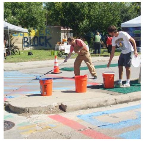
Paint crosswalks at intersections and in the middle of long streets to facilitate pedestrian crossings.