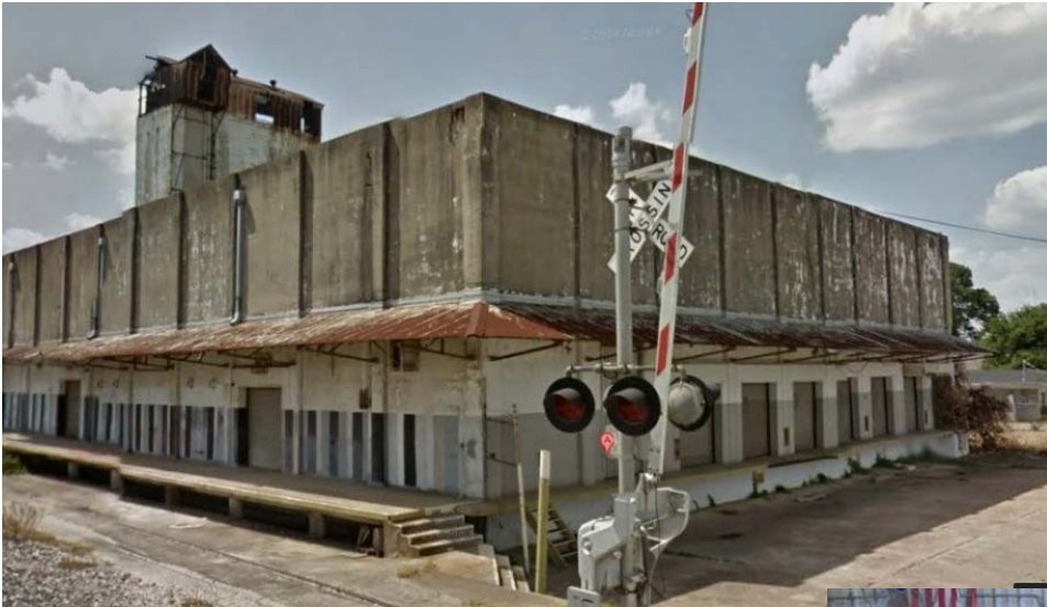
The Silo in the 5 th Ward