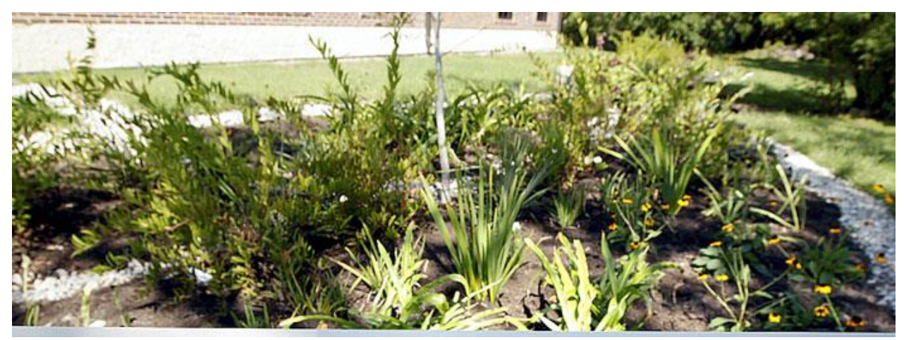
Galveston County Daily News