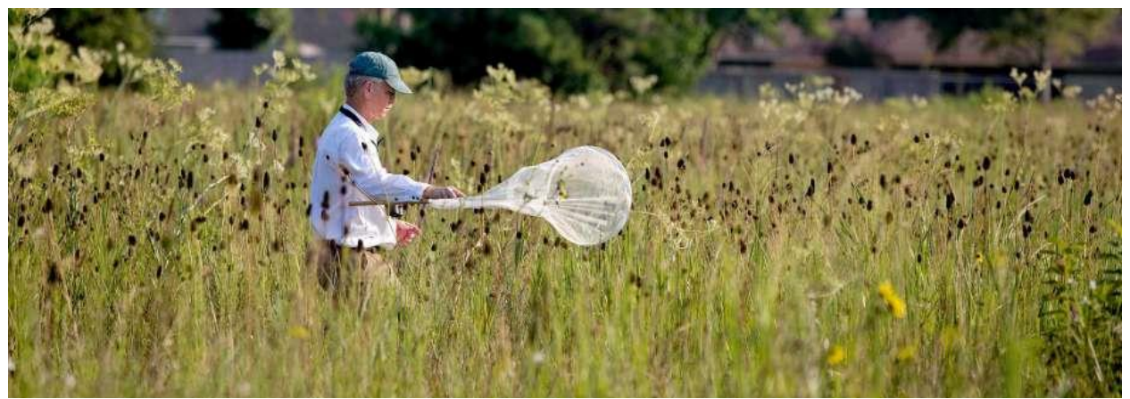
Thomas B. Shea / The Houston Chronicle

Location 29.669407556464613, -95.10861146616814