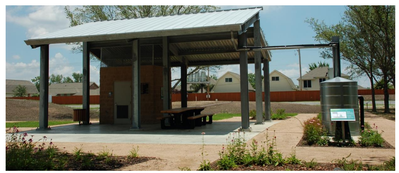
Texas A&M Agrilife Extension

Location 29.52020253910558, -95.06412446184558