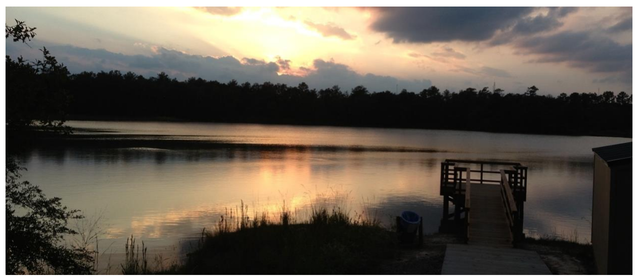
Timber Lane Utility District

Location 30.044595974900837, -95.40357946293089