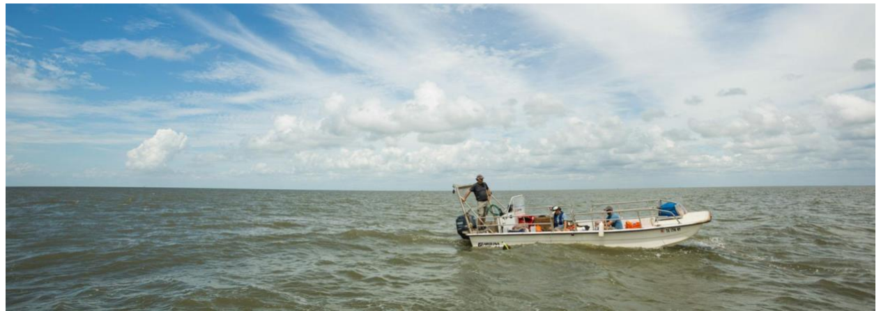
The Nature Conservancy