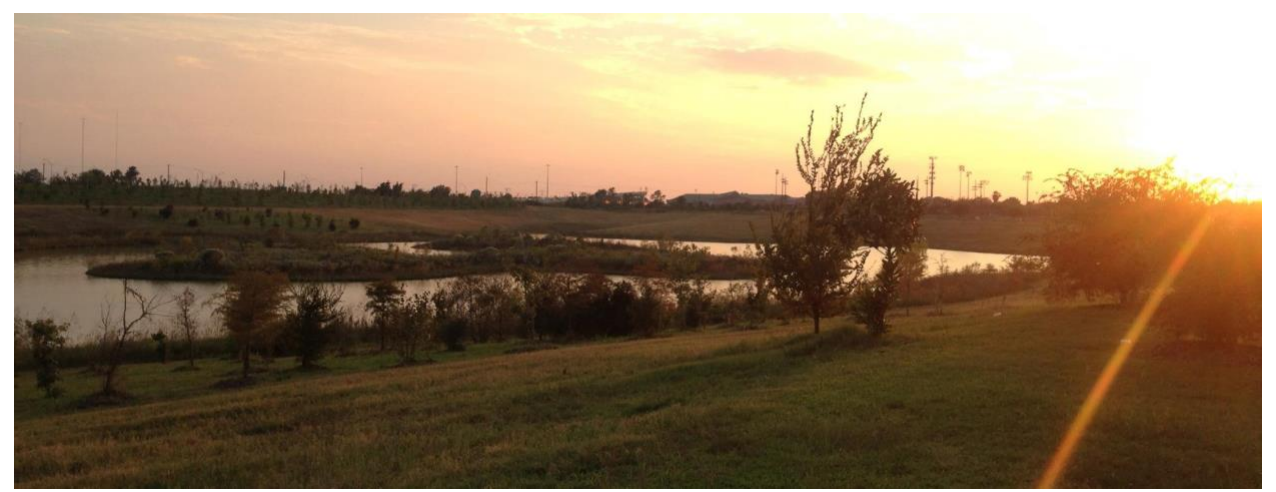
Willow Waterhole Greenspace Conservancy

Location 29.656073378716894, -95.47125829251416