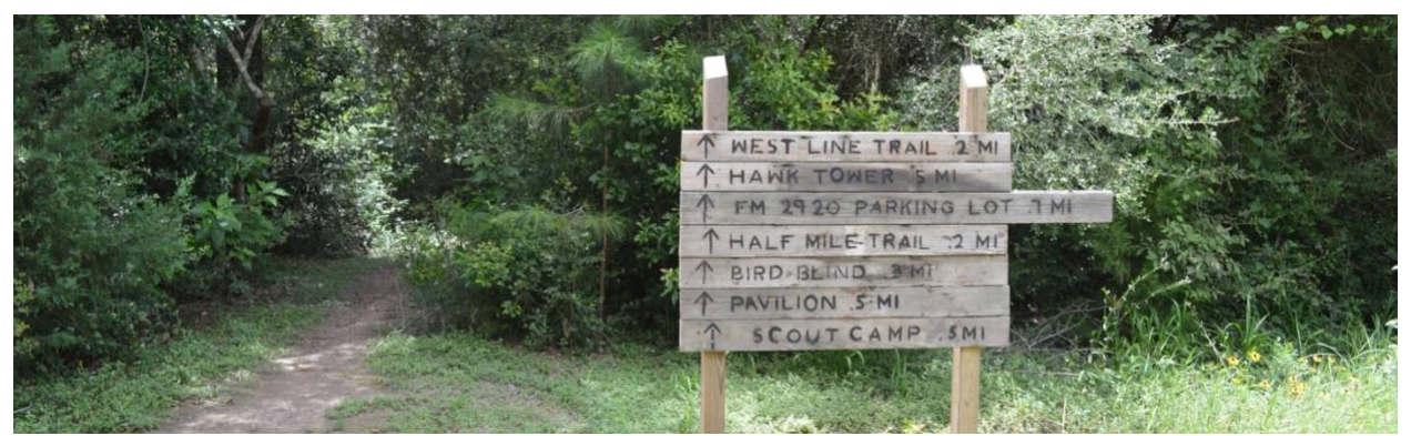
Places to Visit in Tomball, Houston Prime Realty

Location 30.06954815899563, -95.73872394670487