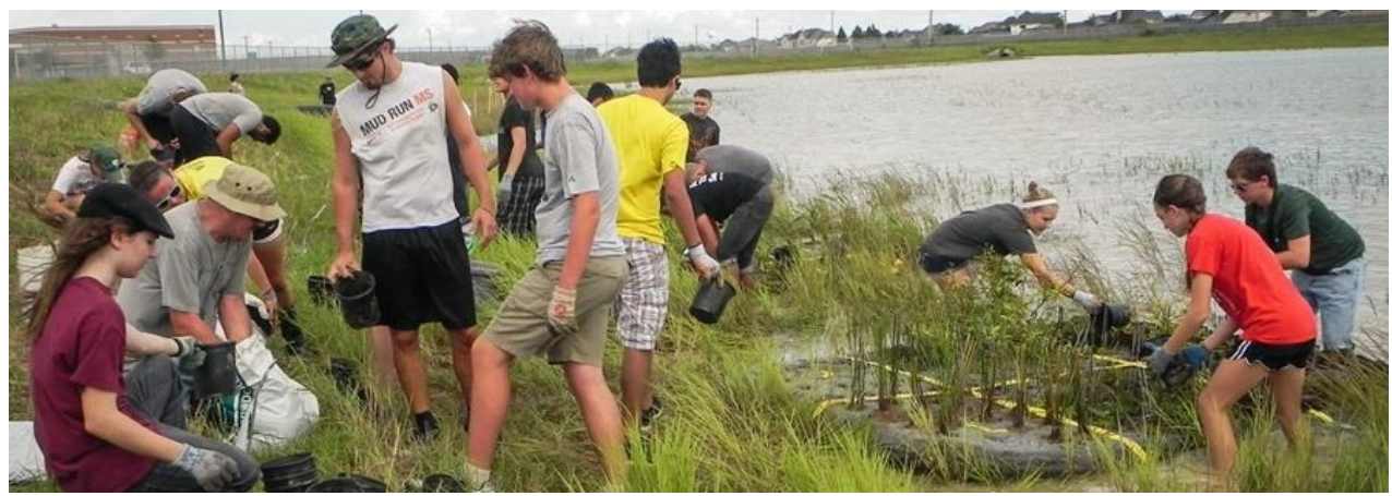
University of Houston, Clear Lake

Location 541 S. 75th Street, Houston, TX 77023