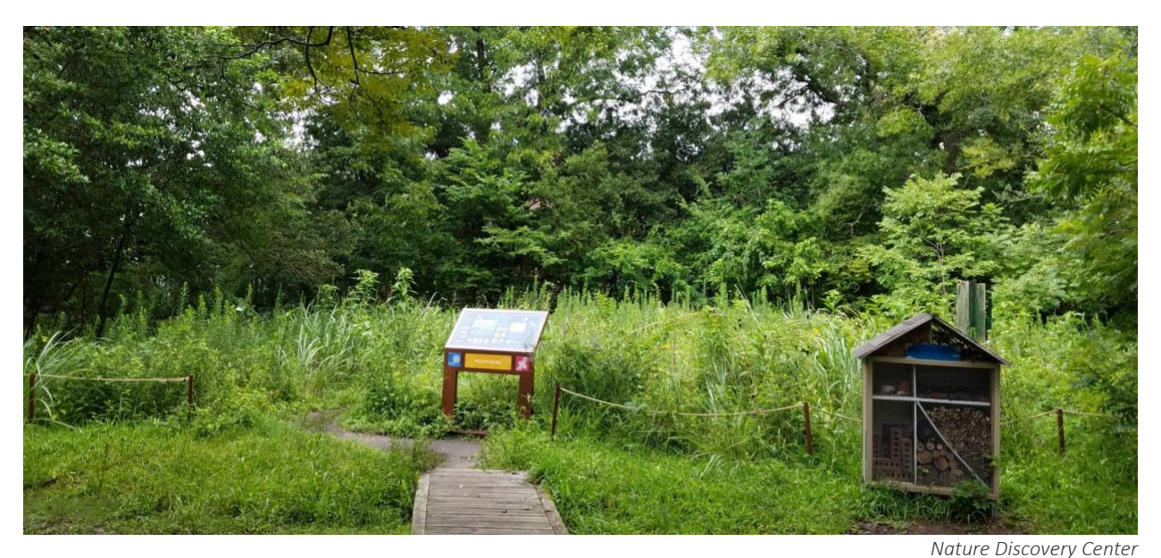
Location 7112 Newcastle St, Bellaire, TX 77401