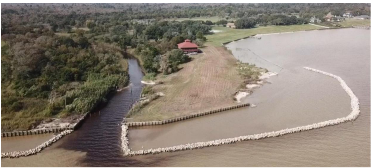
Galveston Bay Estuary Program

Location County 12110 Farm to Market Rd 2354, Baytown, TX 77523 Chambers