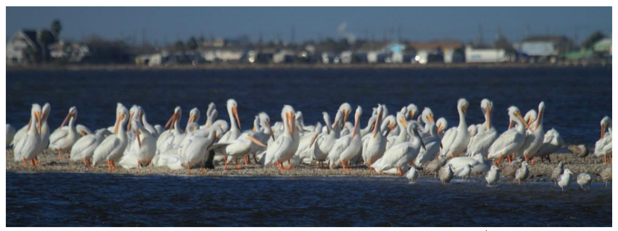
The Nature Conservancy

Location 702 Highway 146 North, Texas City, TX 77590