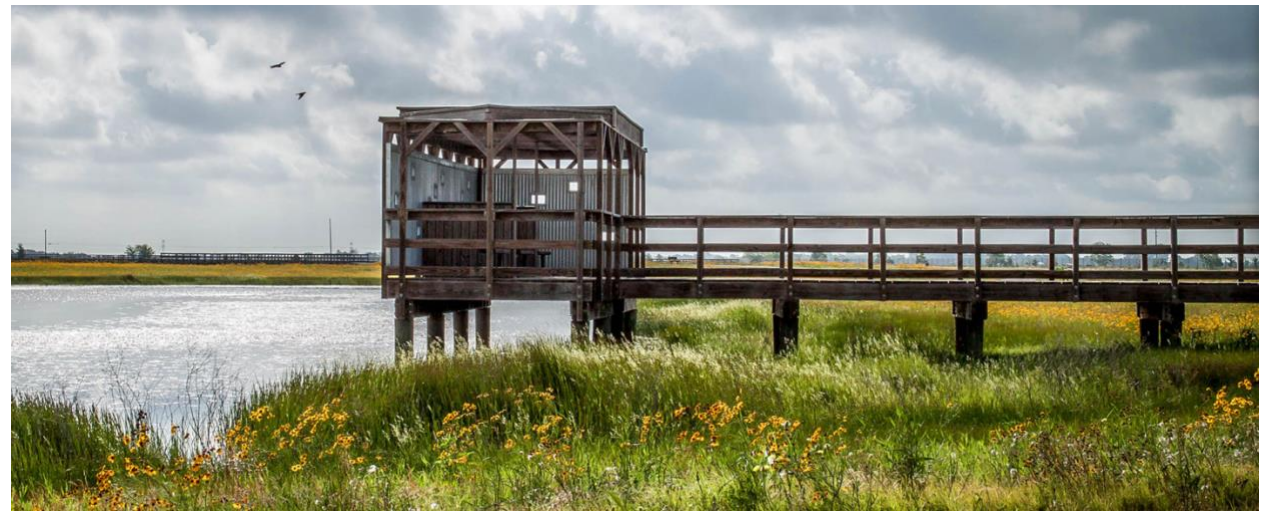
Harris County Precinct 3

Location 9114 Katy Hockley Rd, Katy, TX 77493