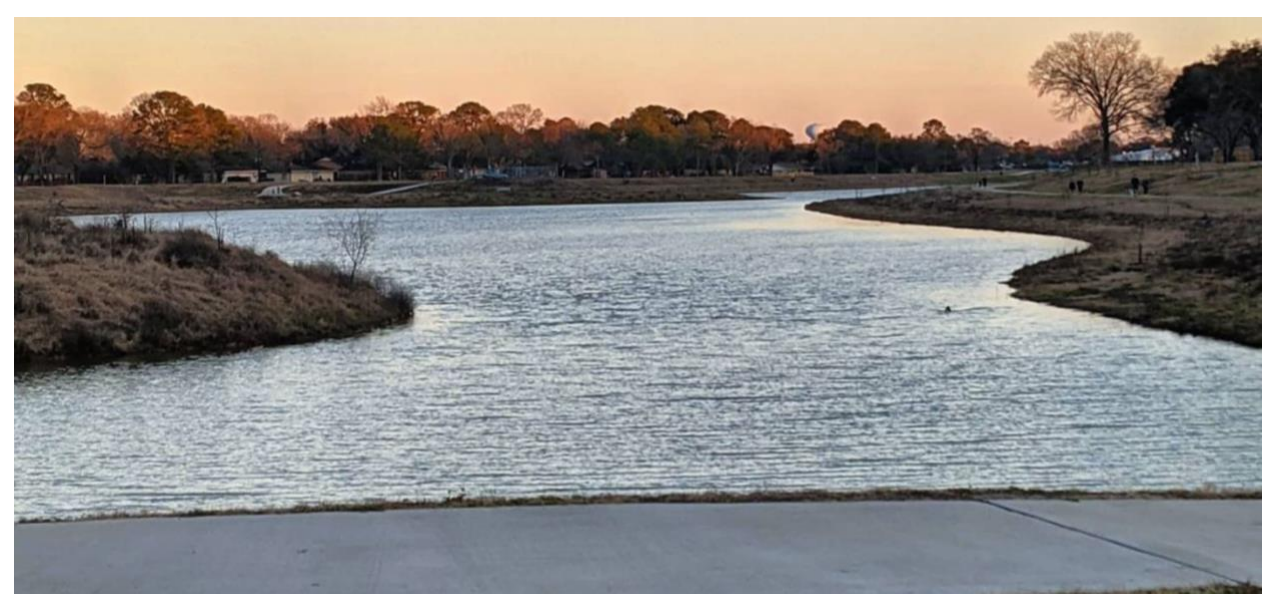
Exploration Green Conservancy

Location 16306 Diana Ln, Houston, TX 77062