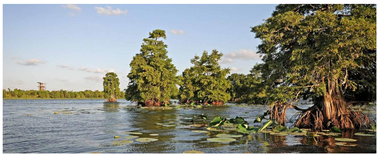
Texas Parks and Wildlife