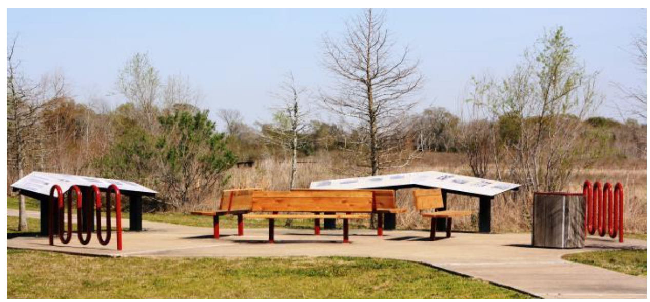
City of Pearland

Location 1801 Kingsley Dr Pearland, TX 77584