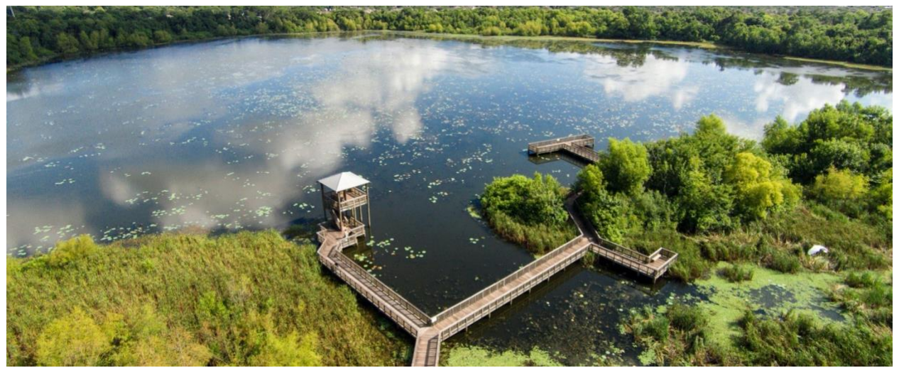
City of Sugarland

Location 29.635138805787292, -95.6606254611041