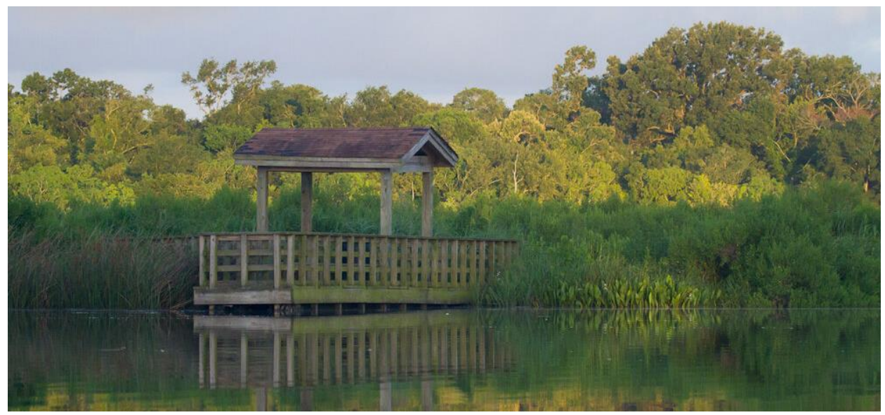
Armand Bayou Nature Center

Location 29.591060857683576, -95.07639093583833