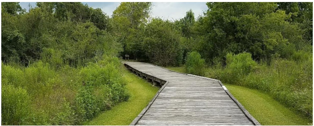
Texas Parks and Wildlife

Location 29.529404450771697, -95.08864126028577