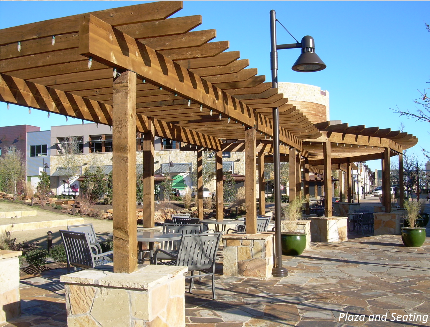
Plaza and Seating