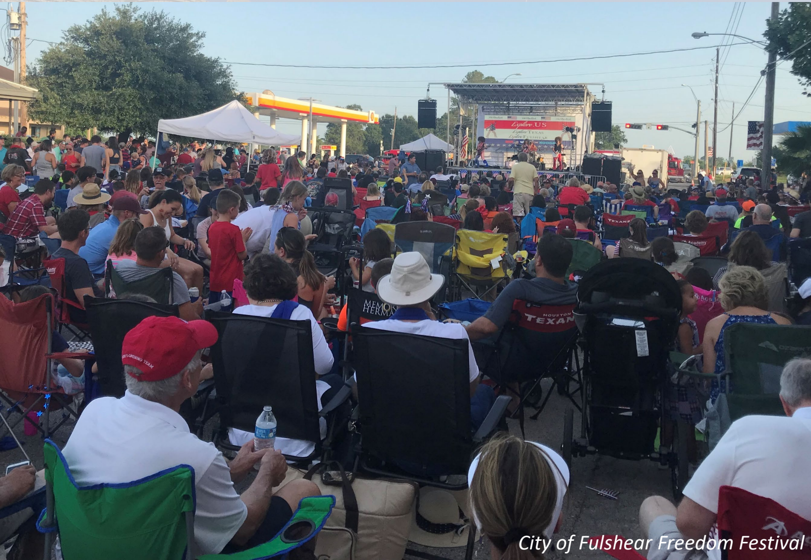
City of Fulshear Freedom Festival