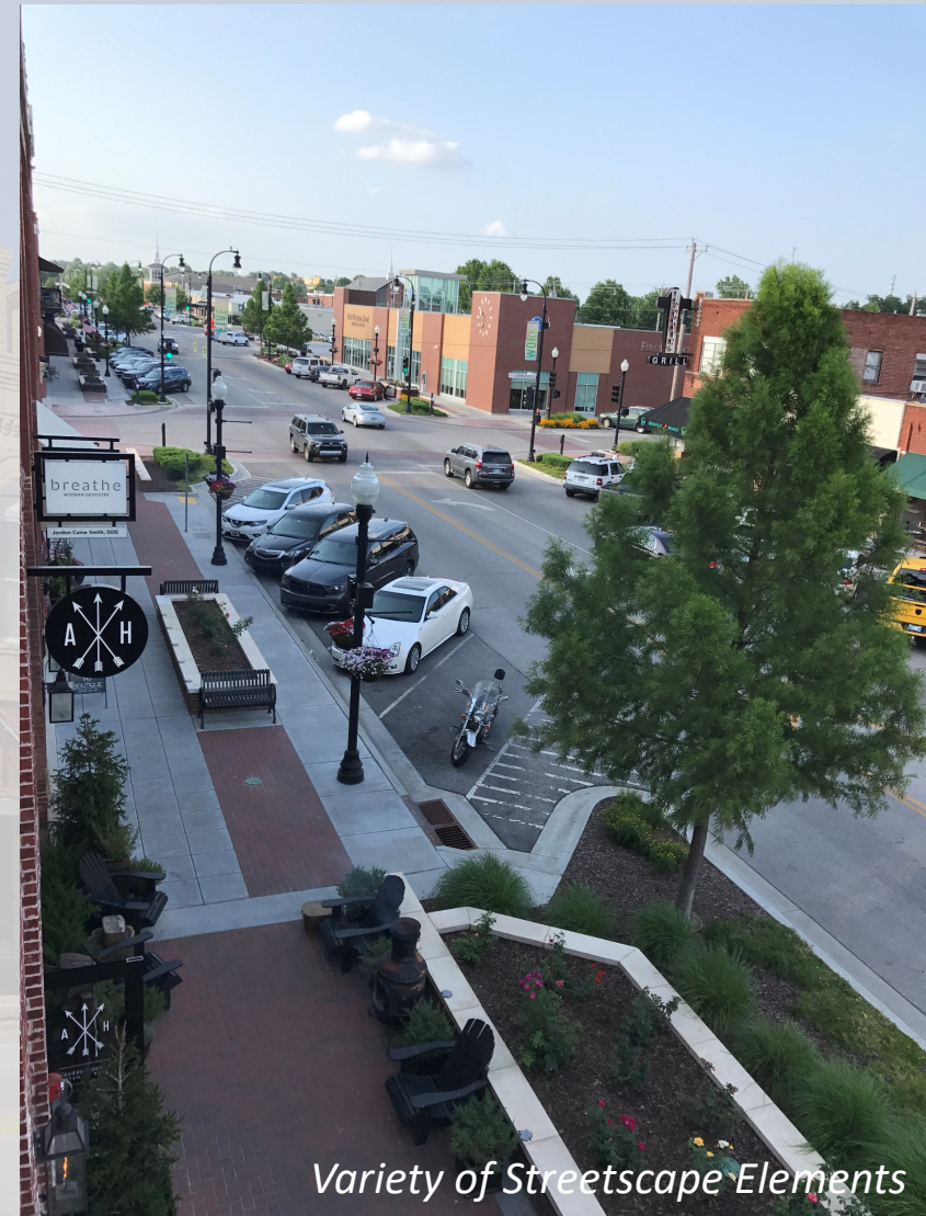
Variety of Streetscape Elements