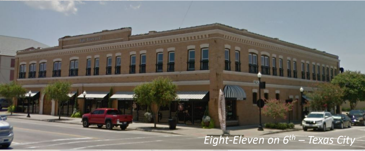
Eight-Eleven on 6 th – Texas City