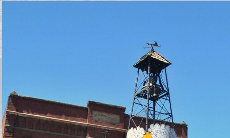
Natural Features and Landmarks