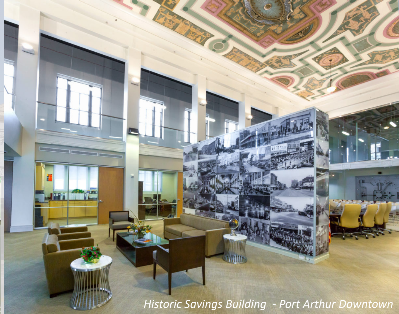
Historic Savings Building - Port Arthur Downtown