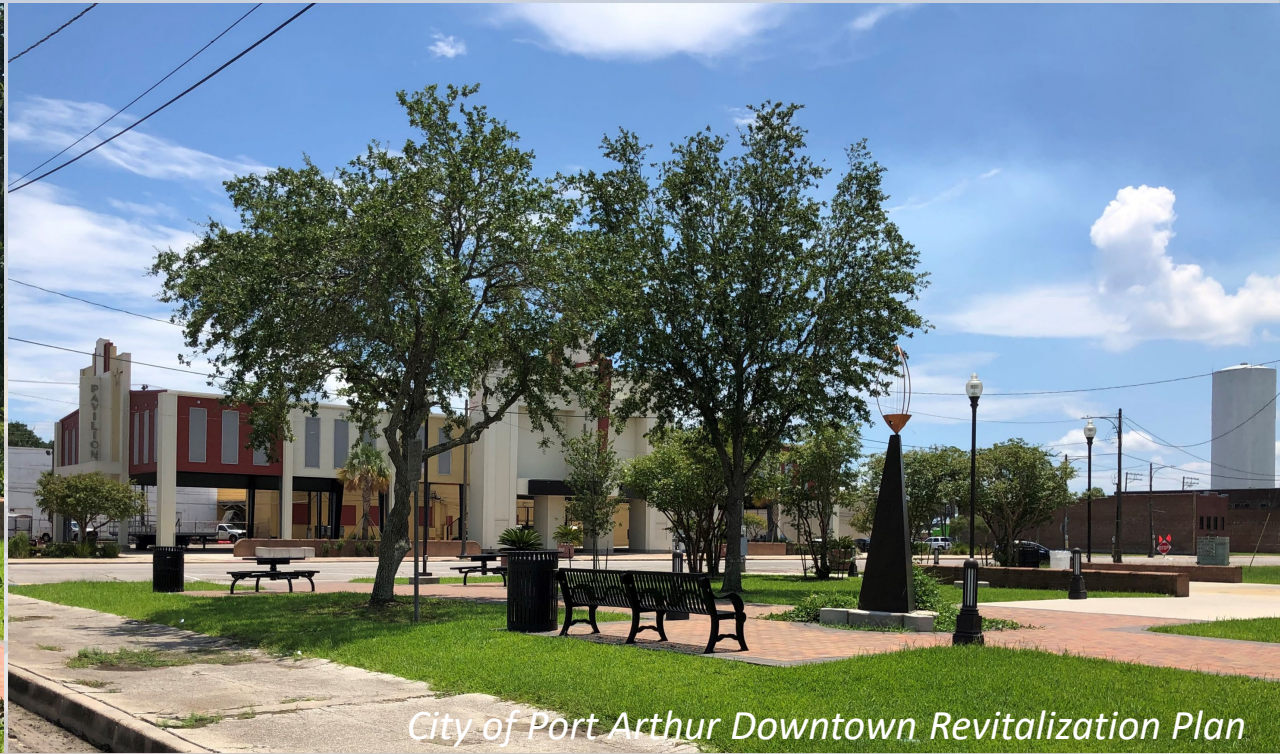
City of Port Arthur Downtown Revitalization Plan