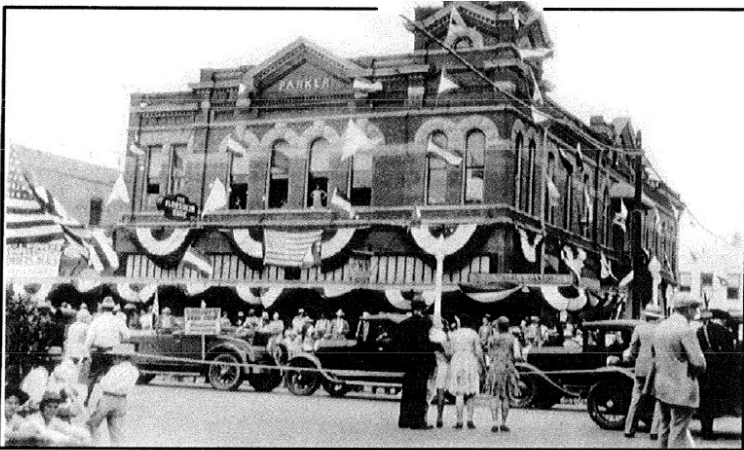
The Downtown Historic District and Other Local Commercial Historic Resources