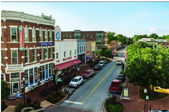
SMALL TOWN Small scale development On-street parking