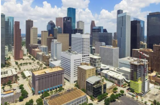
URBAN CENTER +1 million SQ-FT Multiple parking options