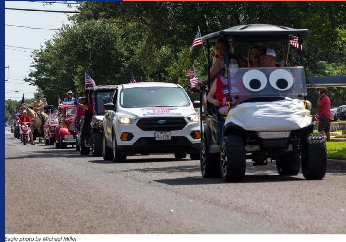
Eagle