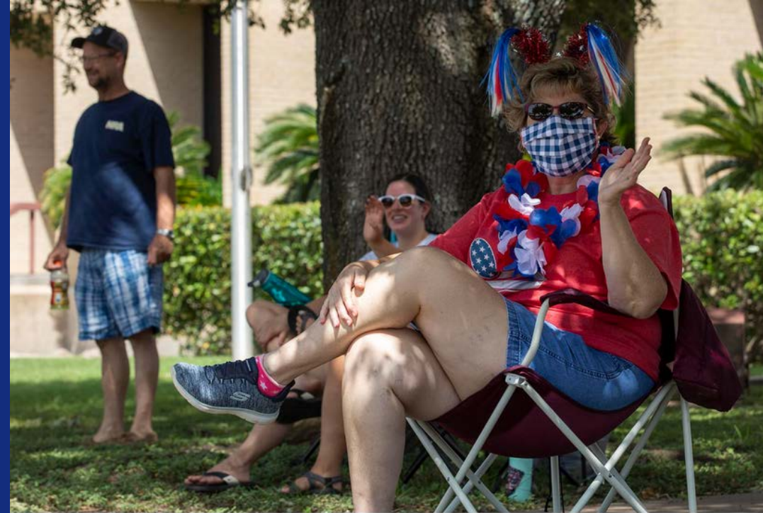
Eagle