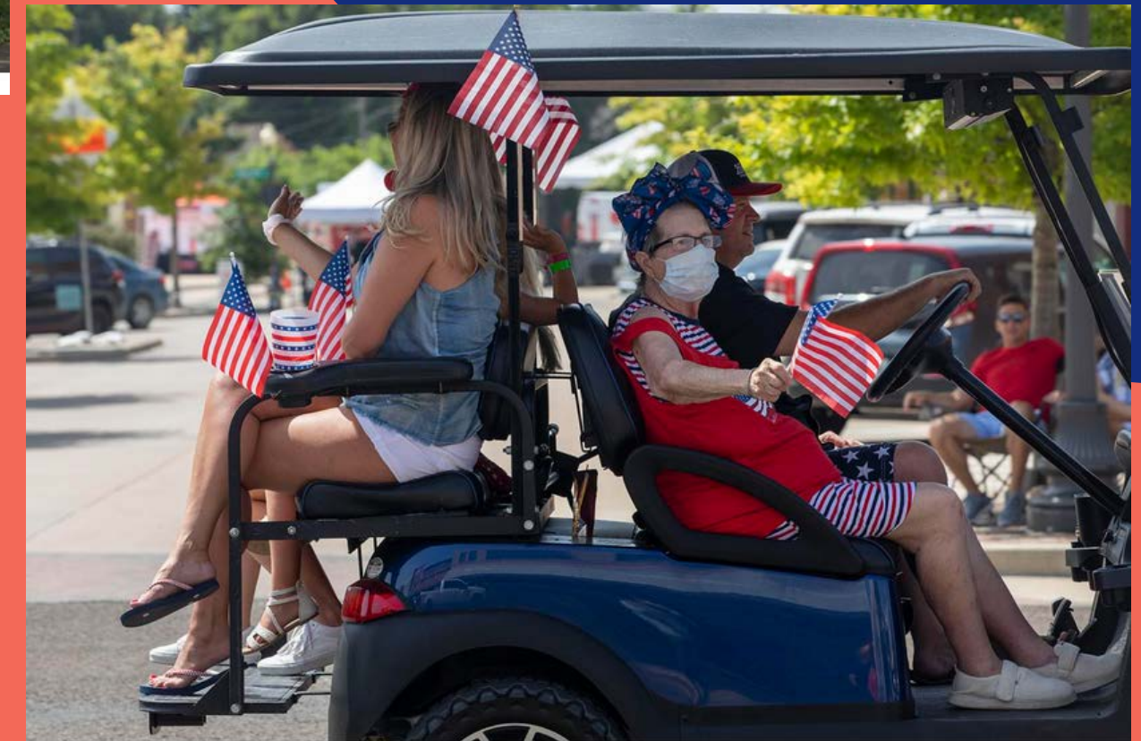
Eagle