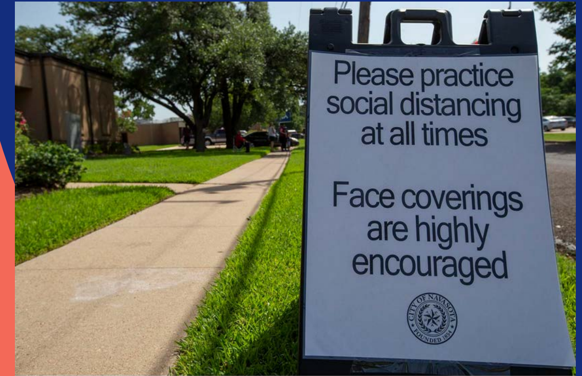
Eagle