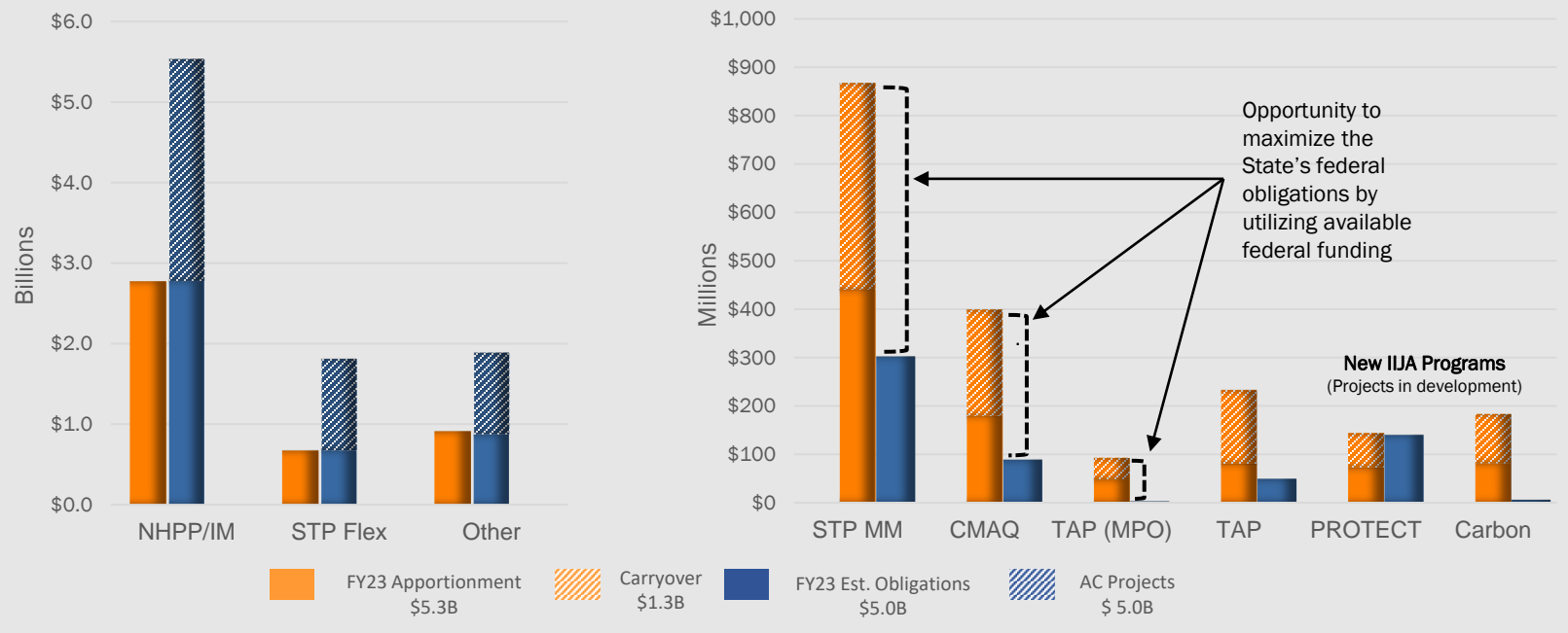
In FY 2023, Texas had $6.6B in available apportionment (including carryover) but could only ask for $465M of redistribution for a total of $5.0B in obligation due to underutilized federal programs.

- TxDOT can only leverage federal programs with available apportionment such as STP MM, CMAQ & TAP