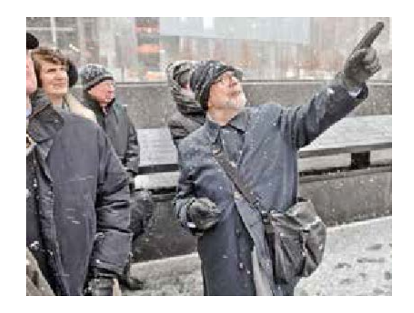
ULI J.C. Nichols Prize for Visionaries in Urban Development