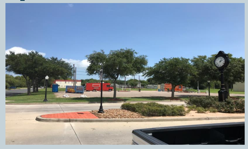
6<sup>th</sup> Street, Lot Cleared and Ready