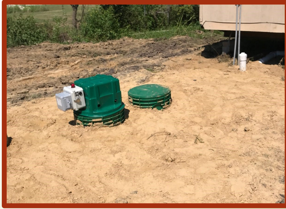
Failing conventional system