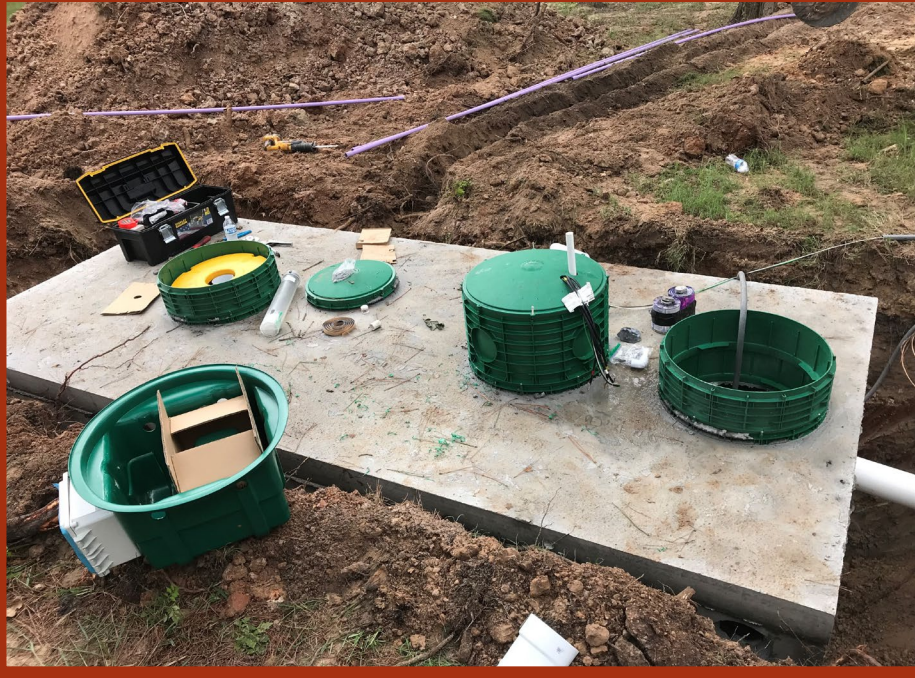
Pipe discharging to field