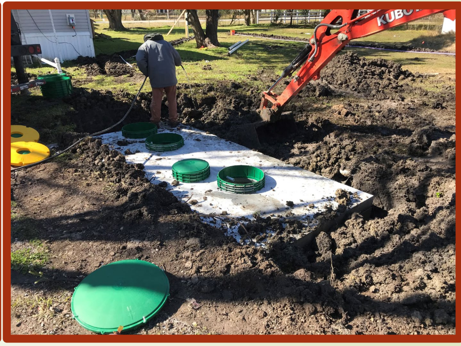
Failing conventional system