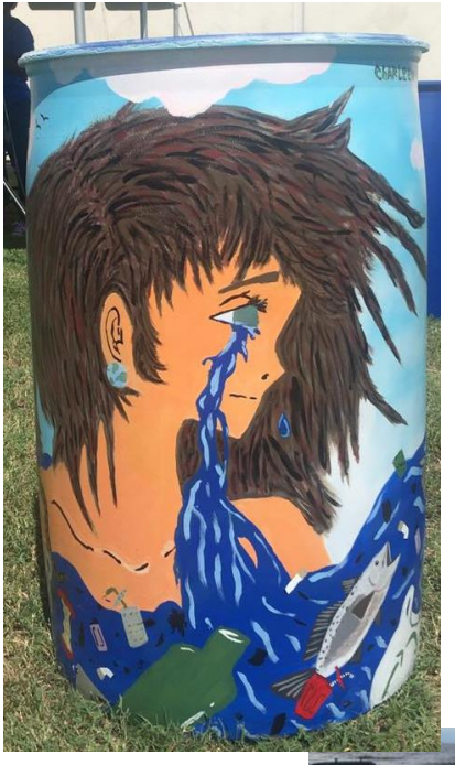
170 barrels beautified with messages