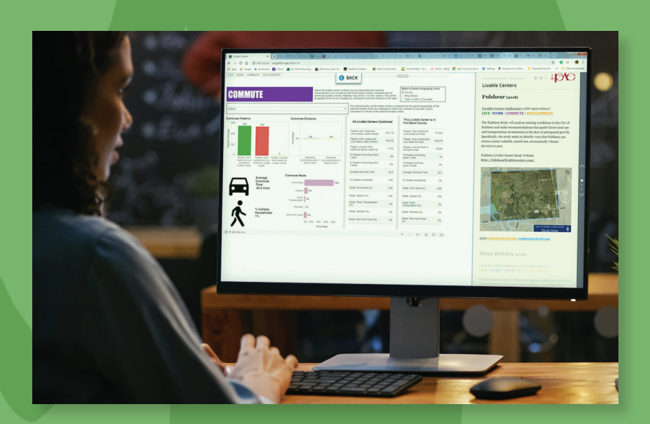
For more information visit http://arcgis02.h-gac.com/lc.

This tool was created in 2018 as a direct result of this evaluation. We heard the program needs to better track the success of its studies and resulting project implementation. We're doing it.