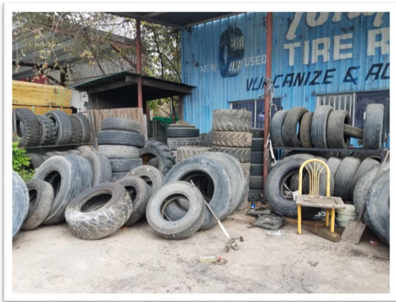
Tires exposed to the elements and unsecured