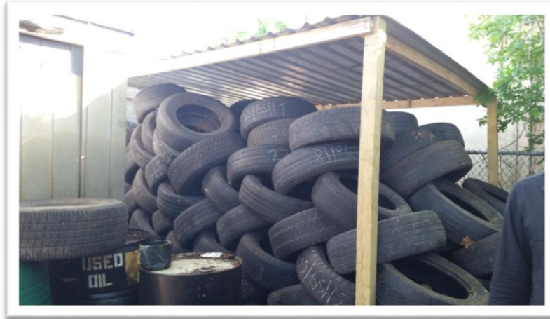
Not all tires are covered