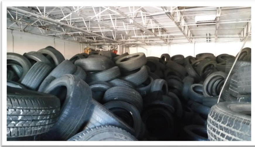
Blocking the exits