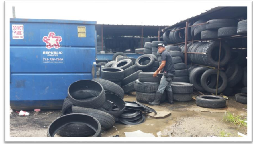
Processed tires into the dumpster