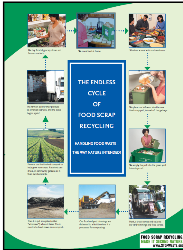
Figure B-1: Sample Nature Cycle Educational Piece