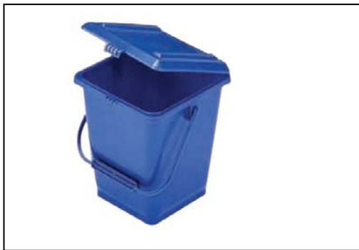
Figure 3-3: Kitchen Pail

Some local governments do not allow the use of plastic liners due to consumer confusion with conventional plastic. These communities encourage residents to use compostable boxboard or newspaper to line their kitchen pails. In addition, some local governments encourage residents to use aseptic containers (e.g., gallon ice cream containers, paper milk cartons) to collect food scraps before placing them into the kitchen pail. This keeps food scraps contained and minimizes required cleaning.