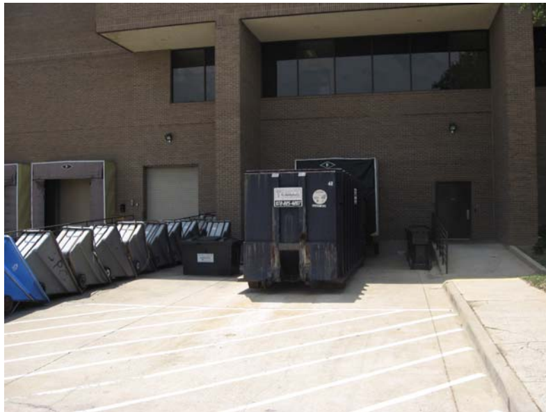
Figure 4-4: Docking Area with Ramp and Vehicle Access