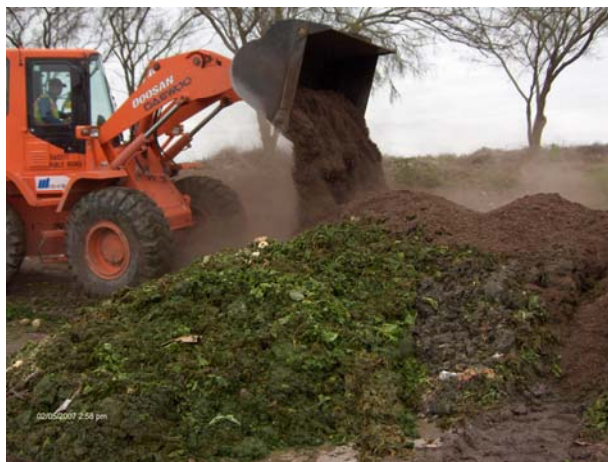
Figure D-4: Covering Exposed Food Scraps with Yard Trimmings

City staff then use the wheel loader to close the trench in the windrow to ensure that all food scraps are covered with a layer of yard trimmings.