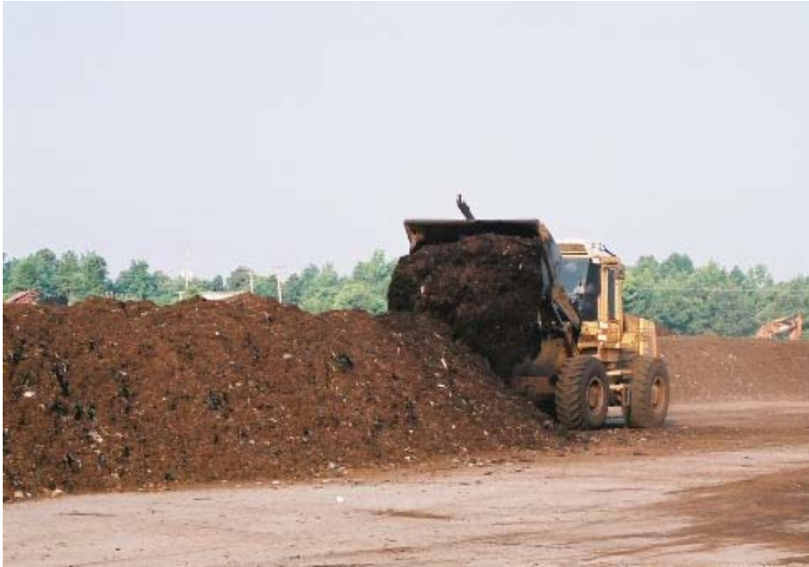
Figure A-2: Windrow formation at the City of Little Rock Composting Facility

Once ground, the materials are then shaped into a windrow formation using a wheeled loader as shown in Figure A-2.