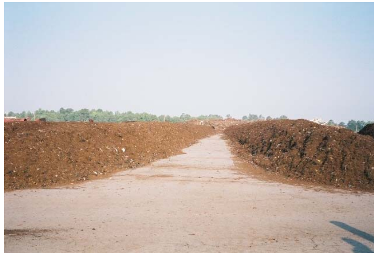
Figure 5-1: Recommended Windrow Spacing of 10 to 15 Feet

One of the most important design considerations for the processing area is the ability to maneuver windrow turning equipment, front end loaders, water trucks, and other necessary equipment in the aisles between the windrows. This can be accomplished by planning aisles that are approximately 10 to 15 feet wide. However, different windrow turning equipment may have different design requirements. For instance, utilizing a straddle-type windrow turner enables windrows to be grouped in pairs five feet apart with 15 foot aisles between each pair. 2 Using a front end loader to turn windrows requires 15 foot aisles between each windrow. If a side-mounted windrow turner is used, the site should allow for 10 to 15 foot aisles. Communities should consult equipment specifications available from manufacturers of windrow turners during the design process of a composting pad.