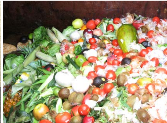
Figure D-2: Contents of Food Scrap Collection Container

These commercial customers include grocery stores, large super-centers, and industrial food processors. The City utilizes a front-load container mover to collect containers from commercial customers. When collecting food scraps, City staff use the container mover to transport an empty container to the site (this vehicle is partially shown in