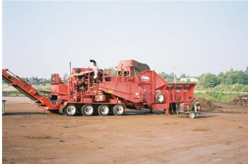
Figure 5-6: Horizontal Grinder

grinder may be a better selection. Horizontal grinders can cost between $350,000 and $400,000.