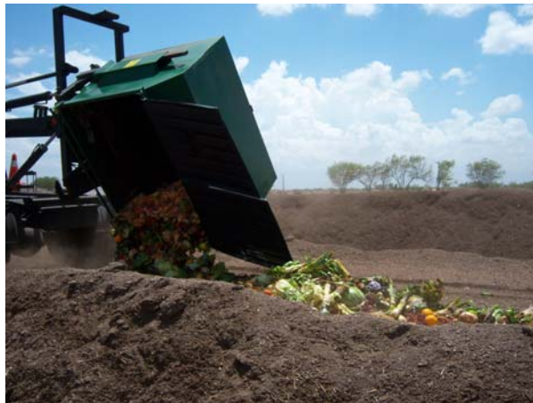
Figure D-3: Addition of Food Scraps to Windrow

When a load of food waste is accepted at the composting facility, employees unload material directly from the container to a trenched windrow. A wheel loader is used to create a trench in the windrow.