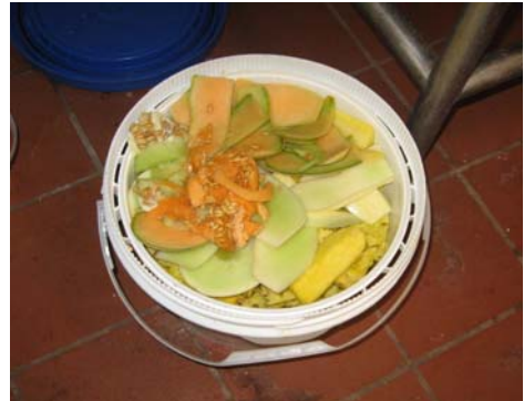
Figure 4-1: Small Pail for Food Scraps