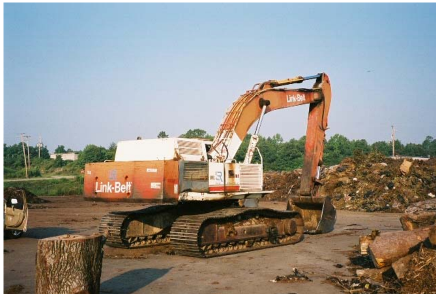
Figure 5-7: Excavator

An excavator can be used on a compost site to load feedstock into a grinder and to load trucks with finished compost in addition to any excavation project that may be necessary. An excavator working in tandem with a track mounted horizontal grinder works well preparing feedstock for compost. An excavator can be equipped with a bucket, a clam shell to grab and hold brush, or scissors to split large logs. The typical cost for an excavator is $150,000 to $300,000, depending on size.