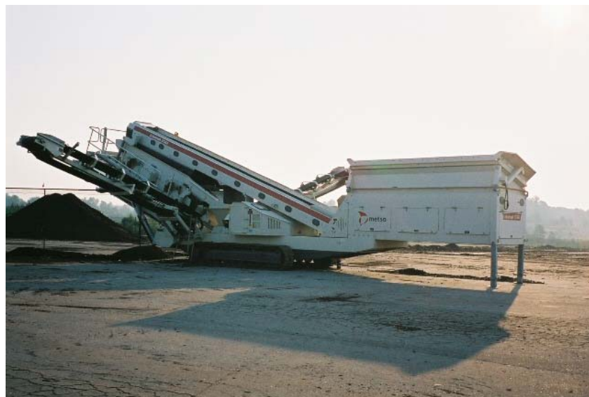
Figure 5-9: Vibratory Screen

A vibrating screen employs a reciprocating or oscillating motion to improve separation. Wire mesh screens of different sizes are used to remove larger particles and obtain the desired size as fine as 1/8 inch. The vibration and slope of the screen works to move oversized material off the screen while the finer particles drop onto a conveyor. The typical cost for a vibratory screen is between $200,000 to $300,000.