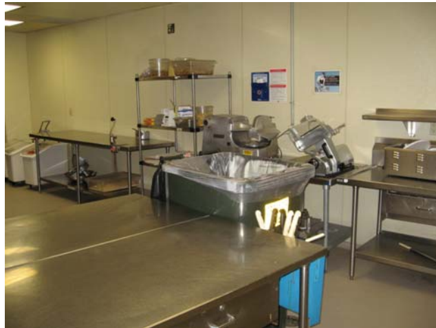
Figure 4-3: Automated Cart for Interior Collection