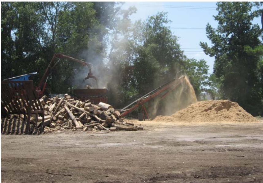
Figure 5-5: Tub Grinder

Tub grinders reduce the size of yard trimmings and other organic materials by moving material over a fixed floor containing hammer-mills. Tub grinders require regular maintenance and replacement of the hammers. Typical cost for a tub grinder can be between $300,000 to $750,000 depending on size.