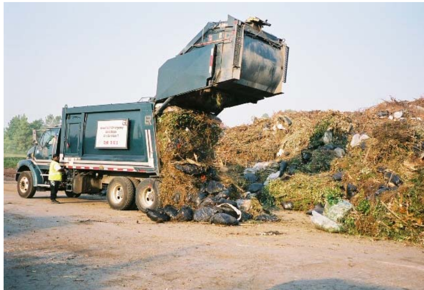
Figure A-1: Residential Yard Trimmings Feedstock Arriving at Compost Facility

The City collects leaves, grass, and bundled brush from residents one time per week using rear-loading collection vehicles. Residents place material in plastic bags or customer-provided garbage cans for collection. The City also has three knuckle boom trucks that are used to collect large brush piles from residents on a call-in basis. City staff brings the residential yard waste material to the mulching and composting area of the City's disposal facility as shown in Figure A-1.