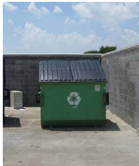
Figure 4-6: Front-Load Container for Organics Collection

Some haulers have utilized plastic front-load containers, as opposed to metal, for organics collection. Plastic dumpsters are beneficial because they do not corrode due to organic contents like metal containers. However, plastic containers may not be as durable as metal containers, and can be more easily damaged from repeated contact with concrete.