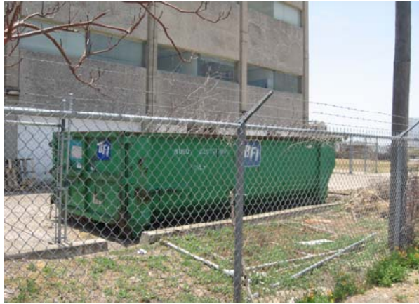
Figure 4-7: Roll-Off Container for Organics

large generator of organics. Roll-offs for commercial organics must be covered. Roll-offs are beneficial to haulers because they do not need a full route to be able to provide the service. In addition, roll-off containers are more easily sealed and can be cleaned each time they are collected. However, roll-offs for food waste should not exceed 25 CY. Larger roll-offs are too heavy to be transported due to the weight of food scraps. If needed, compactors may be used.