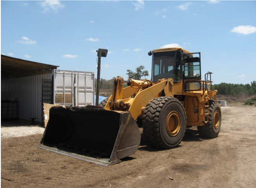
Figure 5-11: Front-End Loader