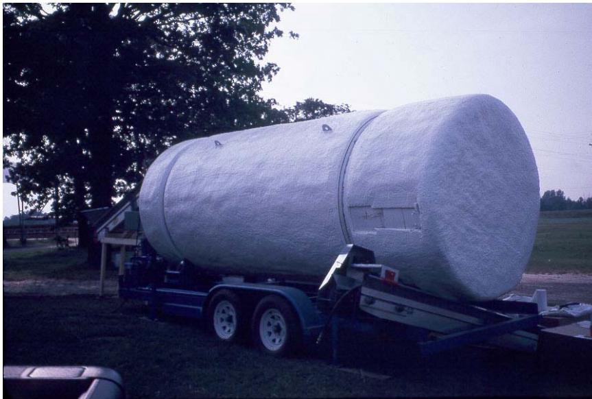
Figure 6-3: Example of In-Vessel Composter

In-vessel composting is the most costly and capital-intensive composting technology. However, it can provide advantages in certain applications. For instance, in-vessel can be an effective technology to process odorous material, such as food scraps and biosolids. Because most in-vessel systems are operated as closed systems, odors can be collected more easily for treatment in biofilters.