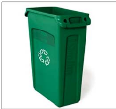
Figure 4-2: Slim Jim Organics Container