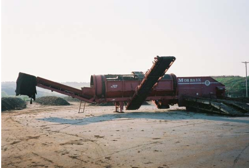
Figure 5-8: Trommel Screen

A trommel screen is a rotating screen that often includes a feed hopper and loading conveyor. The drum rotates and retains larger particles within the drum while fine particles fall through the holes or screen and onto a conveyor. The typical cost for a trommel screen is between $200,000 to $300,000.