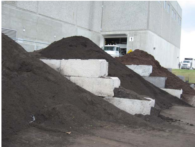
Figure 5-2: Finished Compost Storage Bunkers

The post-processing area includes infrastructure utilized to enforce quality control measures and for the storage of finished compost product. This infrastructure may include a blending operation, a bagging machine and storage for bulk compost. The post-processing area may also be combined with the curing area in some instances. In general, the area required for curing and storage can vary from 25 percent of the composting pad area to twice the pad area for compost with biosolids feedstock due to the length of time required for curing and stabilization.