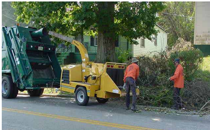
Figure 3-2: Example of Loose Collection of Brush (Using a Chipper for Volume Reduction)

In some cases, communities may supplement a weekly or bi-weekly containerized yard trimmings collection program with a seasonal or post-storm event loose yard waste collection. This provides residents with added convenience at times when the generation of yard trimmings peaks, and still allows for a more regularly scheduled option that could potentially incorporate food scraps at some point.