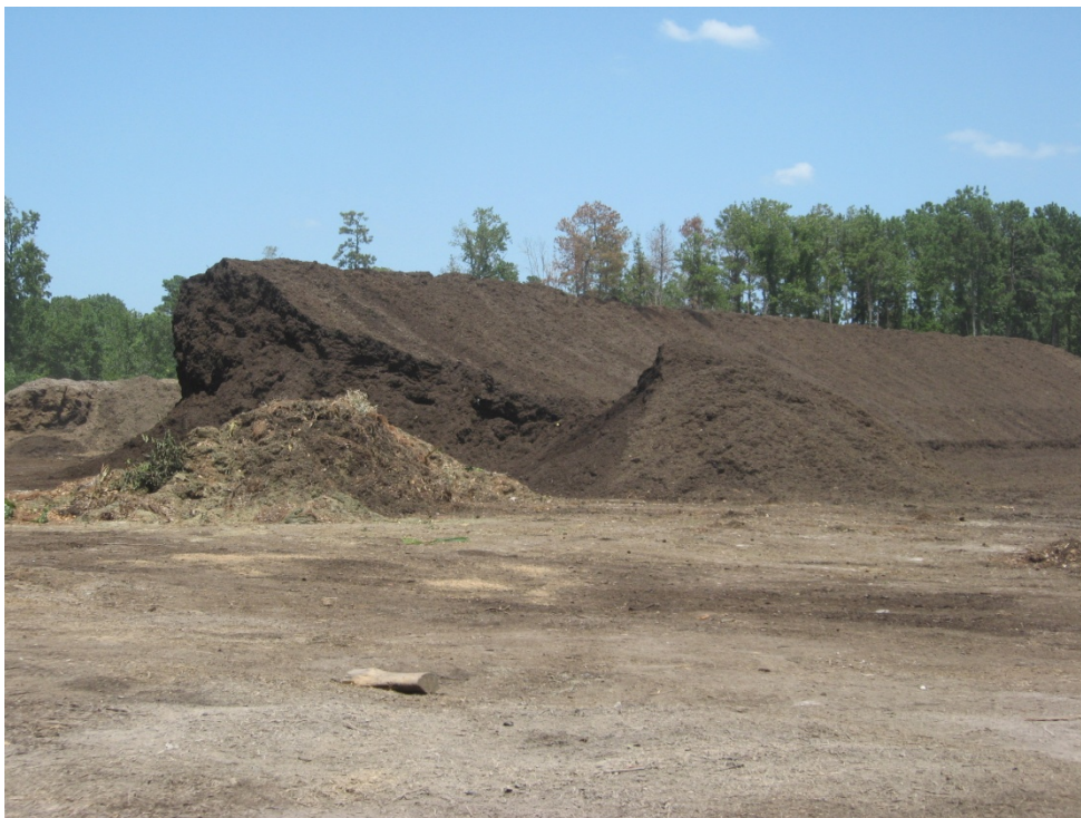
Figure 6-1: Static Pile Composting Facility (Nature's Way, Conroe, TX)

In addition, if piles are constructed to be too large, the pile temperature can get too high, creating a potential fire hazard for the facility. Once temperatures inside of the pile reach 190 degrees Fahrenheit, the heat acts as a catalyst for chemical reactions that generate even more heat and at a faster rate. When the pile shifts because of volume reduction and fresh air (oxygen) comes into contact with the super-heated material, spontaneous combustion occurs and causes fire in the pile.