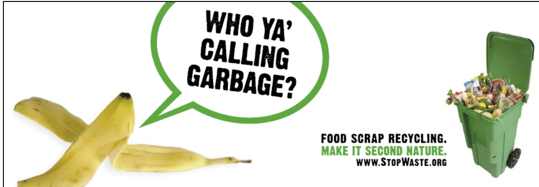
Figure B-2: Sample Billboard with Common Educational Elements