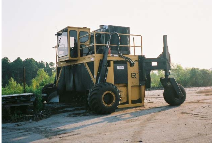
Figure 5-10: Self-Propelled Windrow Turner

Windrow turners are available in a variety of sizes and designs. Pictured is a self-propelled windrow turner. This type of turner allows windrows to be spaced approximately five feet apart and may be 10 to 20 feet wide and as tall as 10 feet. The typical cost of a windrow turner depends on style and size, but the range can be between $250,000 to $350,000.