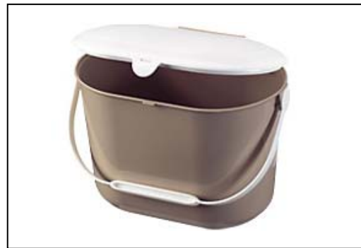
Figure 3-4: Kitchen Pail