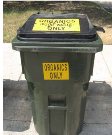
Figure 4-5: Automated Cart for Organics Collection

If generators plan to collect primarily food scraps in their cart, it is recommended that the size not exceed 64 gallons, as the carts are not able to be maneuvered if they get too heavy.