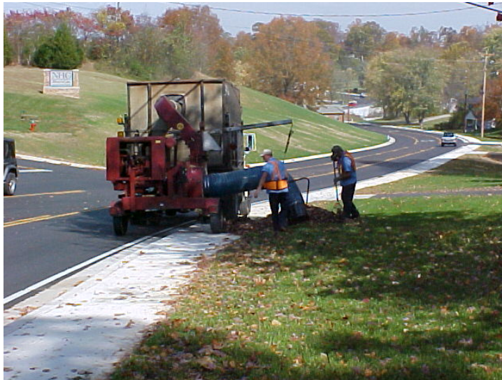
Figure 3-1: Example of Vacuum Truck for Loose Collection of Leaves