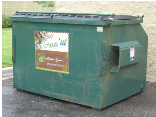
Figure D-1: Food Scrap Collection Container

Through the "Save the Greens" program, the City also collects food waste from several commercial customers within the City limits on Mondays, Wednesdays and Fridays. An example food scrap collection bin and its contents are shown in Figure D-1 and Figure D-2.