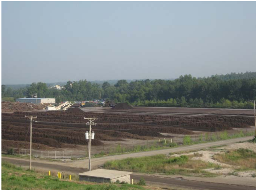
Figure 6-2: Windrow Composting Facility (City of Little Rock Municipal Compost Facility)

Windrow composting is the most common technology utilized in Texas for municipal composting. Windrow composting involves forming long piles that are turned on a regular schedule. The size, shape and spacing of each windrow is directed by the type of equipment utilized to turn each pile. For smaller operations, front-end loaders are utilized to turn piles, while larger operations typically utilize specialized windrow turners. Windrow aeration is primarily accomplished through natural air movement, similar to static piles. Air is also introduced into the pile during periodic turning.