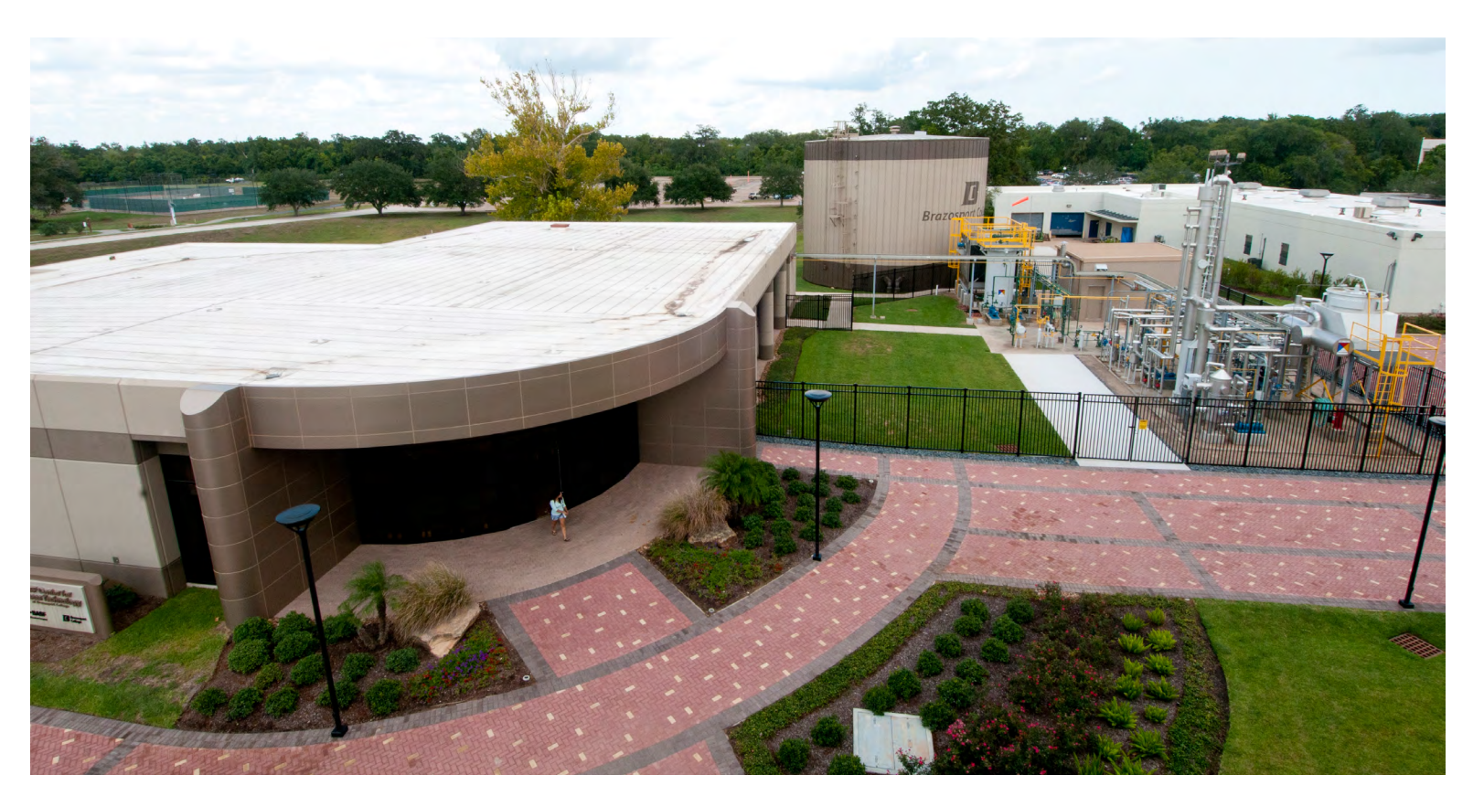
Brazosport College provides training for students and partner industry through a variety of programs and classes. The campus is also home to a full-scale PET (Polyethylene terephthalate, a general-purpose plastic) Plant training facility for hands-on instruction and continuing education.

If the region is to be economically resilient, it needs to change these trends to respond to the increasing demand for skilled blue-collar labor.